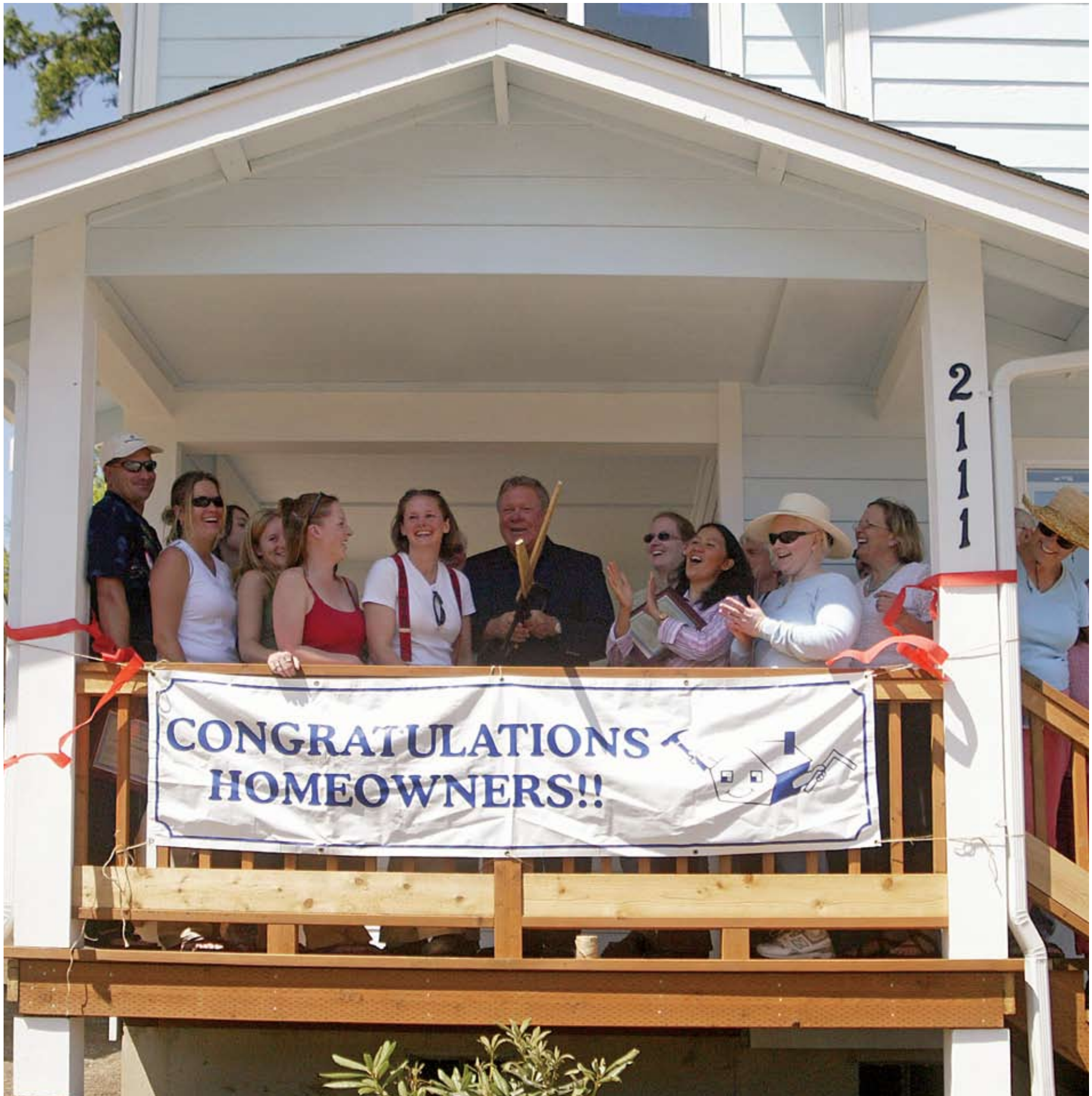
US CONGRESSMAN NORM DICKS JOINS PORT TOWNSEND SELF HELP OWNER/BUILDERS IN CELEBRATING THE COMPLETION OF THEIR HOMES. KCCHA'S SELF HELP PROGRAM — THE LARGEST IN THE PACIFIC NORTHWEST — HAS HELPED OVER 1,000 FAMILIES BUILD THEIR OWN HOMES.